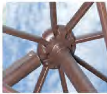
2. Metal Upper Hub