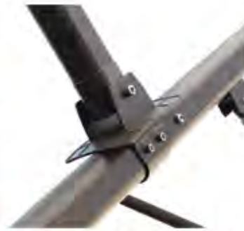
3. Heavy Duty Joint