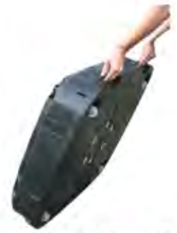
4. Base w/ Handle & wheels