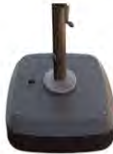
6. Power Base