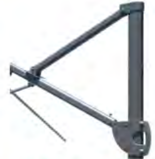
8. Brace Back Tilt