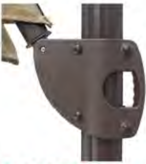
1. GPT Tilt Mechanism