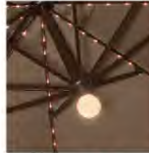
7. Lighting System