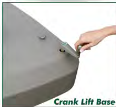
Crank Lift Base

Please see our price list for more detailed product specifications.