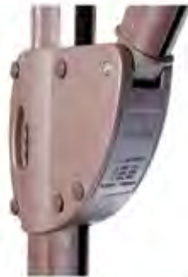
5. GPT Tilt Connector